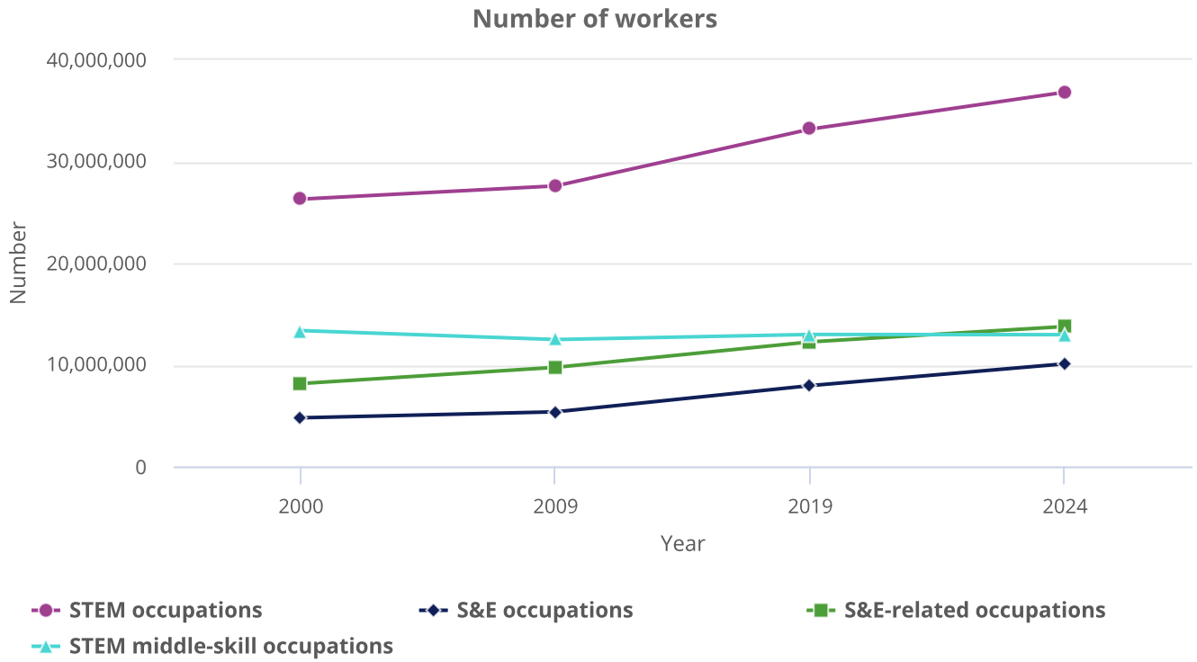
Figure 8. Workers in STEM occupations: 2000, 2009, 2019, 2024